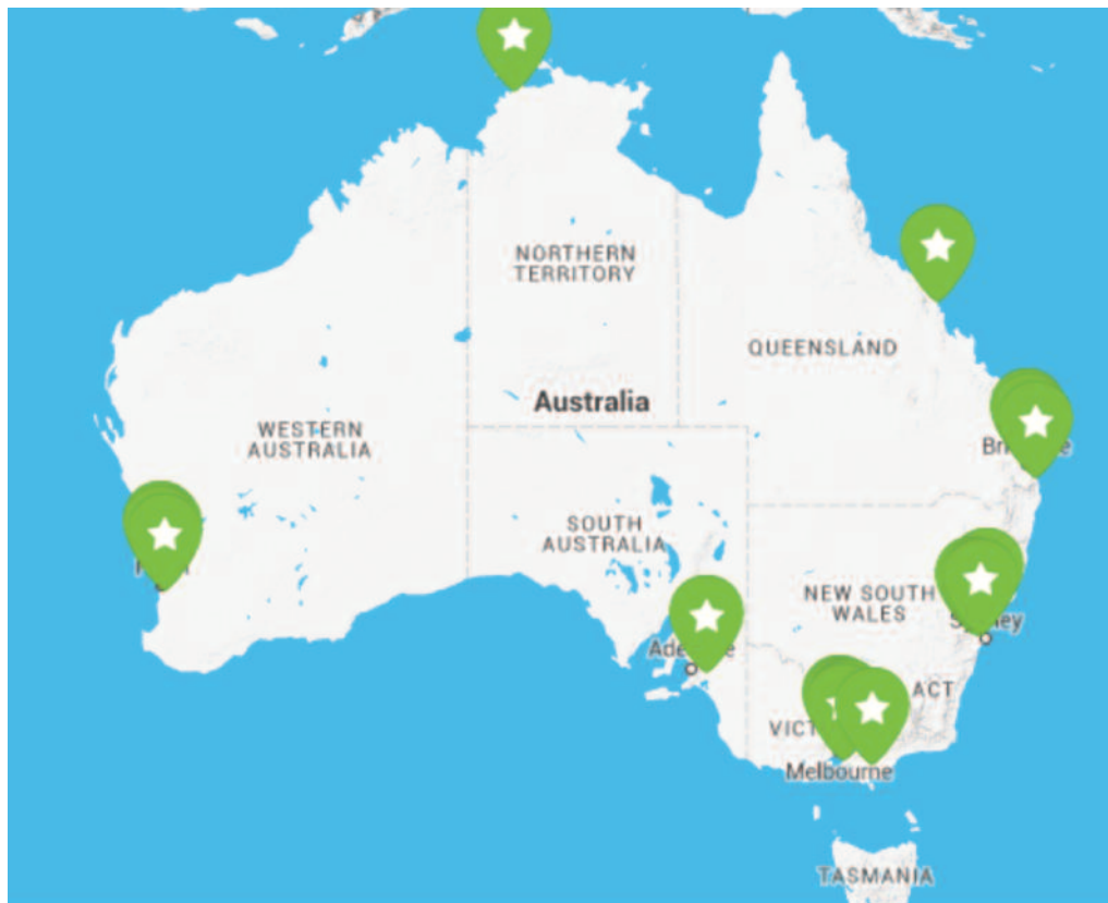
Figure 4. Existing Headspace Youth Early Psychosis Programmes September 2015

Another important development from a policy perspective is greater recognition of the importance of protecting the physical health of all people with psychosis. The National Mental Health Commission has recommended the adoption of the Healthy Active Lives (HeAL) Programme as the standard intervention framework for people with psychosis on antipsychotic medications, to support their physical health and wellbeing, and enable young people experiencing psychosis to have the same life expectancy and expectations of life as their peers who have not experienced psychosis. The policy had previously been adopted within the New South Wales mental health strategy (NSW Mental Health Commission, 2014). Dedicated health coaching, dietetic support, exercise programmes and youth peer wellness coaches, provided as part of a first episode psychosis service in Sydney, have recently been evaluated in a small scale study which reported statistically significant differences in weight gain compared to standard case management services (Curtis et al., 2015).