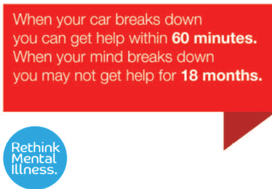
Figure 1: Rethink 'Getting help early' – campaign slogan late 1990s