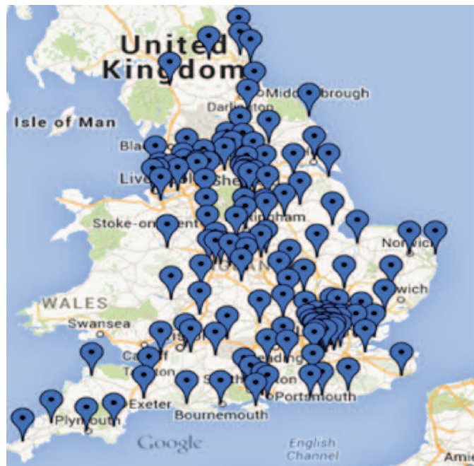
Figure 3: Early Intervention Services in England in 2014