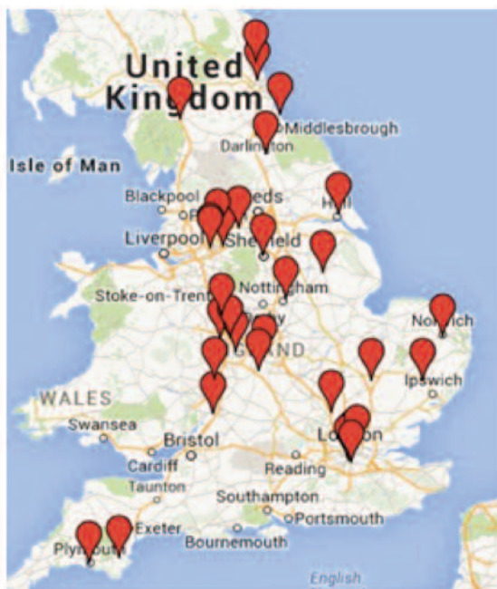
Figure 2: Early Intervention Service Provision in England in 2003

By far the most extensive network of EI services in Europe are to be found in England. In 2000 the government's NHS Plan stated that 50 EI services would be established to provide treatment and active support in the community to young people and their families; the aim was to provide services to 7,500 young people experiencing a first episode of psychosis each year by 2004 (Department of Health, 2000). Early intervention services are now to be found in most local health service catchment areas in the country; each service may have multiple teams in operation and overall there were more than 150 teams operating in 2014, supporting about 10,000 people per year (Rethink Mental Illness, 2014). This represents a considerable proliferation of services since they first started to appear as shown by Figures 2 and 3.